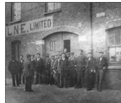
Early-twentieth-century workers outside Lott & Walne.