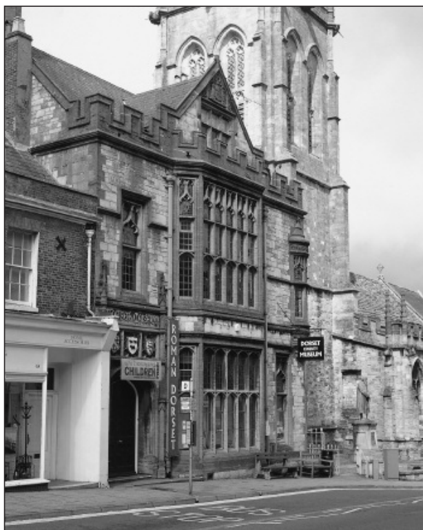
Dorset County Museum.