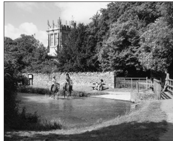
Right: St Mary's, Charminster; showing the right of way along the Cerne.