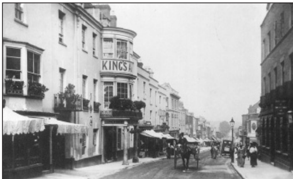
Above: A view down High East Street with the Kings Arms on the left, c.1911.